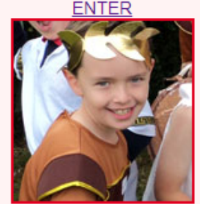
Clubs/Family Learning After school clubs and family learning