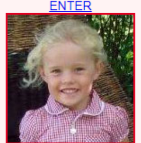
Red Oaks Values Education Promoted termly across